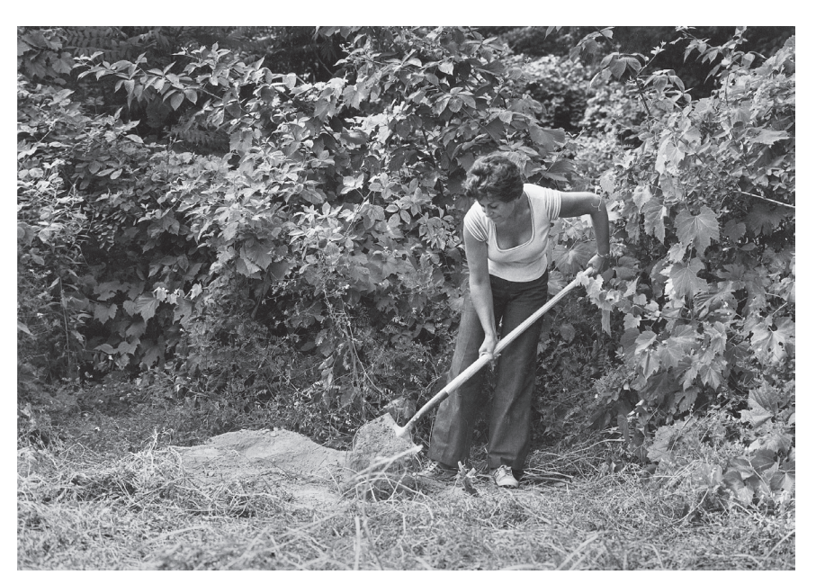
Agnes Denes: Rice/Tree/Burial in Artpark, Lewiston, New York, 1977-79, gelatin silver prints; at the Shed.

Also shown on the exhibition's upper floor is ample documentation of Denes's "Public Works" series, the environmental interventions for which she may be best known. Center stage is a presentation of the celebrated Wheatfield—A Confrontation (1982), a Public Art Fund commission for which Denes planted two acres of wheat in the Manhattan landfill that would become Battery Park City. One block from Wall Street, Wheatfield confronted a stronghold of late-capitalist excess with a plainly material gesture toward sustenance as a basic need, highlighting disparities of wealth and well-being and the continuing fact of world hunger. Wheatfield appeared as a brief, shimmering mirage: after four months, Denes harvested the grains and donated them to the touring exhibition "International Art Show for the End of World Hunger" (1987–90).