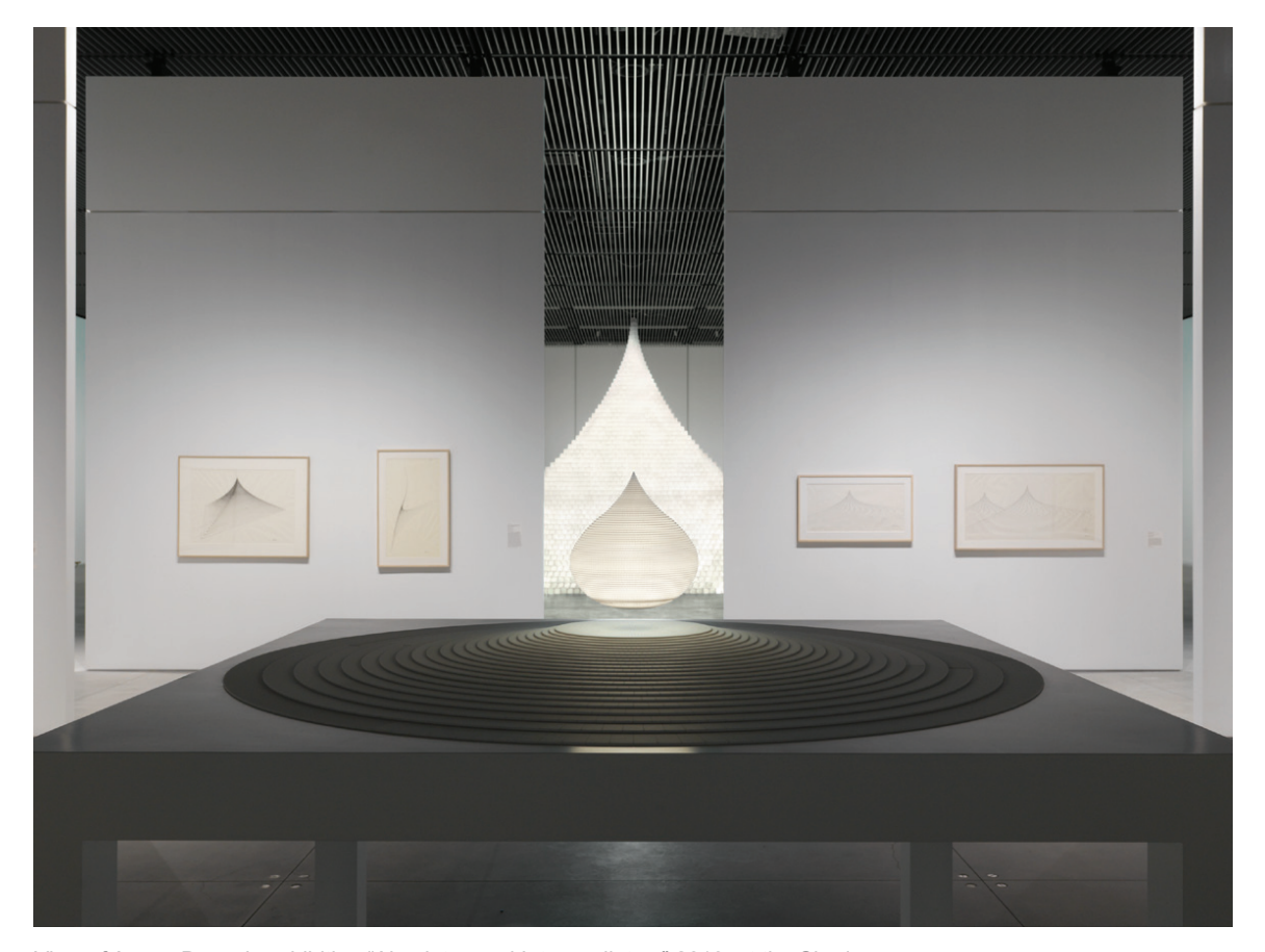
View of Agnes Denes's exhibition "Absolutes and Intermediates," 2019, at the Shed.

The introductory wall text for the Shed's grand retrospective of the work of Hungarian-American artist Agnes Denes (b. 1931), "Absolutes and Intermediates," cites Leonardo da Vinci as a like artistic mind (as do numerous passages in the catalogue). The upper floor of the show presents an exhaustive survey of Denes's work from the 1960s to the present day—drawings dotted with mathematical figures; anatomical studies and finely rendered graphs; and records of her efforts toward land reclamation and environmental remediation. The picture emerges of a prolific, intellectually omnivorous figure devoted to real-world change as much as artistic innovation, and the comparison to Leonardo—that visionary student of geometry and physics, architecture and flying machines—seems less absurd than it might initially have.